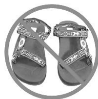
Sandals or Slippers

Participants are requested to arrive in a timely fashion for all addresses, whether to their own, or to those of other presenters. Presenters are reminded that the time slots should be divided fairly and equally between the number of presentations, and that they should not overrun. The session chair is asked to assume this timekeeping role and to summarize key issues in each topic.